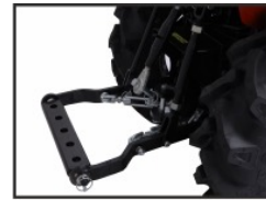
750Kg Lifting Capacity

Narrow Track Option Separately Available in this Model