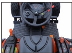
Ergonomic Seating & Footboard Area